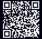
TRB500 360° VIEW