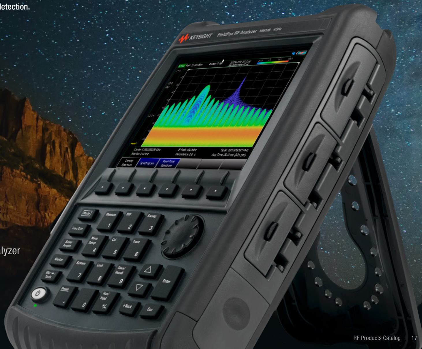
N9913B FieldFox Handheld Microwave Analyzer

Interference is everywhere — and traditional analysis is not reliable. This white paper discusses interference sources, the flaws of traditional analysis, and how real-time spectrum analysis (RTSA) improves interference detection.