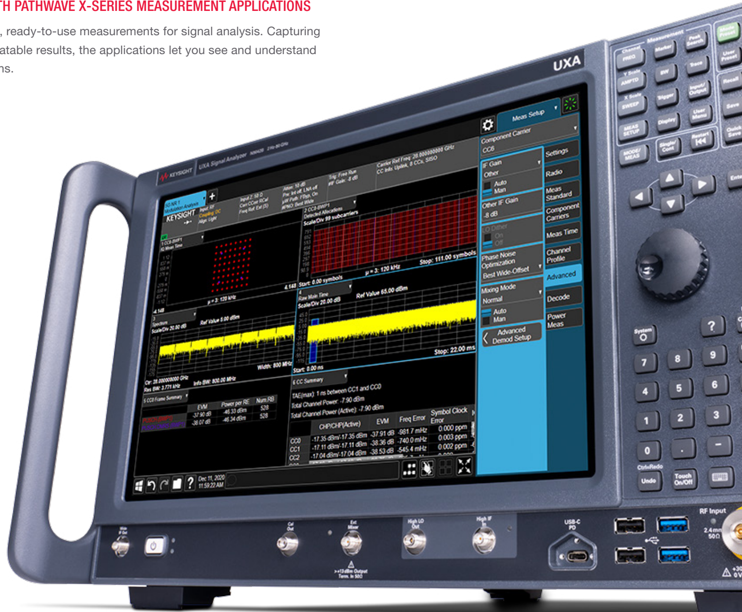
N9042B UXA X-Series Signal Analyzer

PathWave X-Series applications are proven, ready-to-use measurements for signal analysis. Capturing measurement expertise and delivering repeatable results, the applications let you see and understand the performance of your devices and designs.