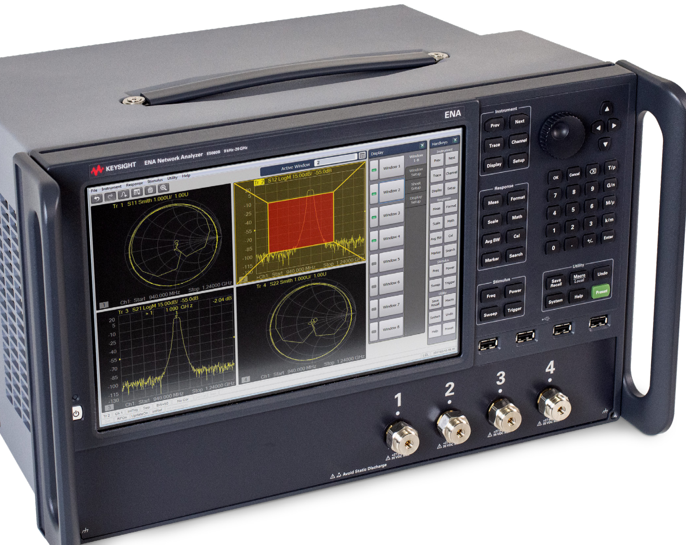
E5080B ENA Vector Network Analyzer