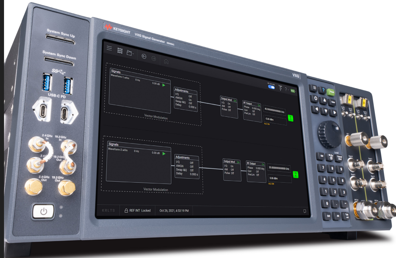
M9484C Microwave Vector Signal Generator