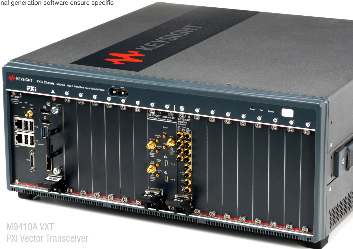
M9410A VXT PXI Vector Transceiver